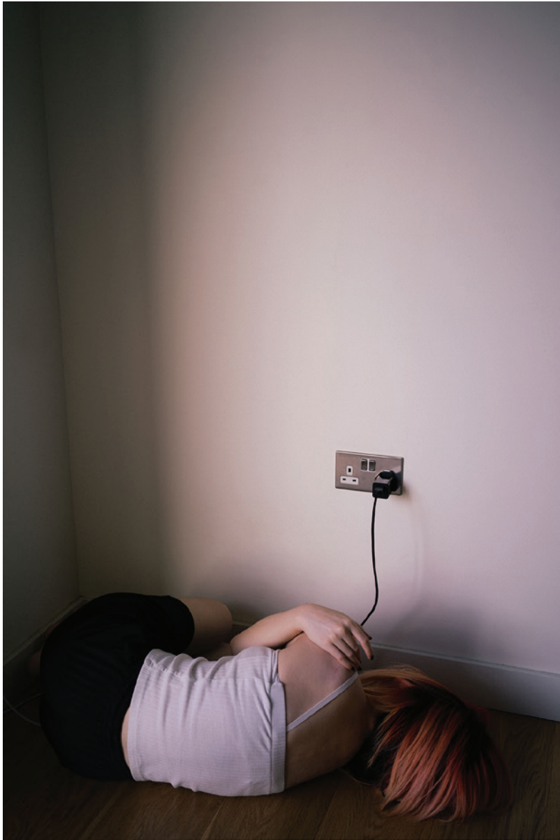
'Illusive Lover', 2023