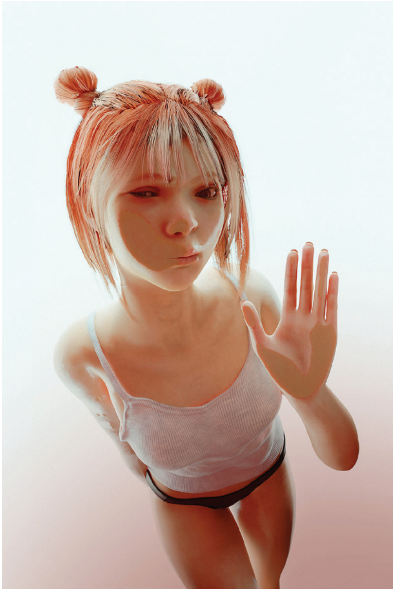
'Illusive Lover', 2023