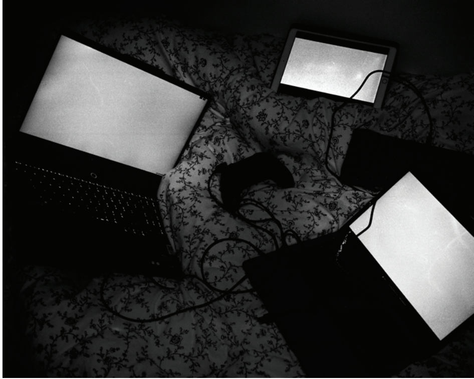
'Dream Before Existence', 2023