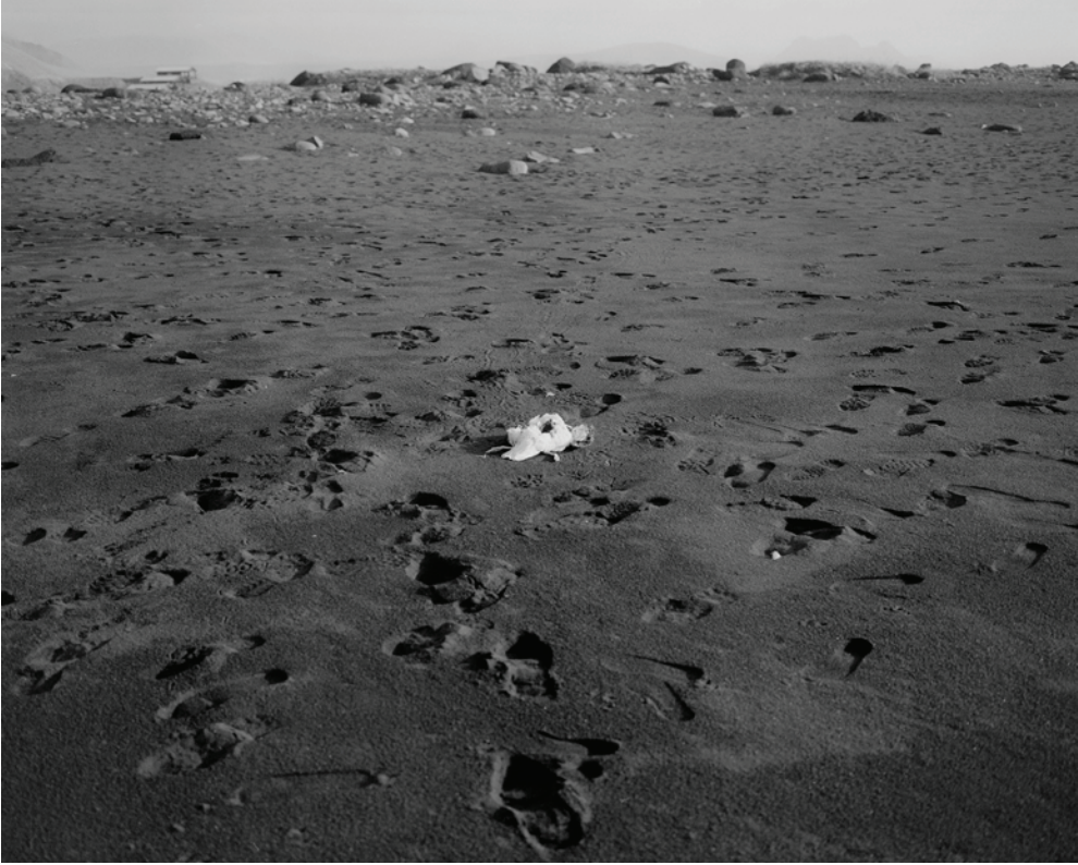
'Dream before Existence', 2023