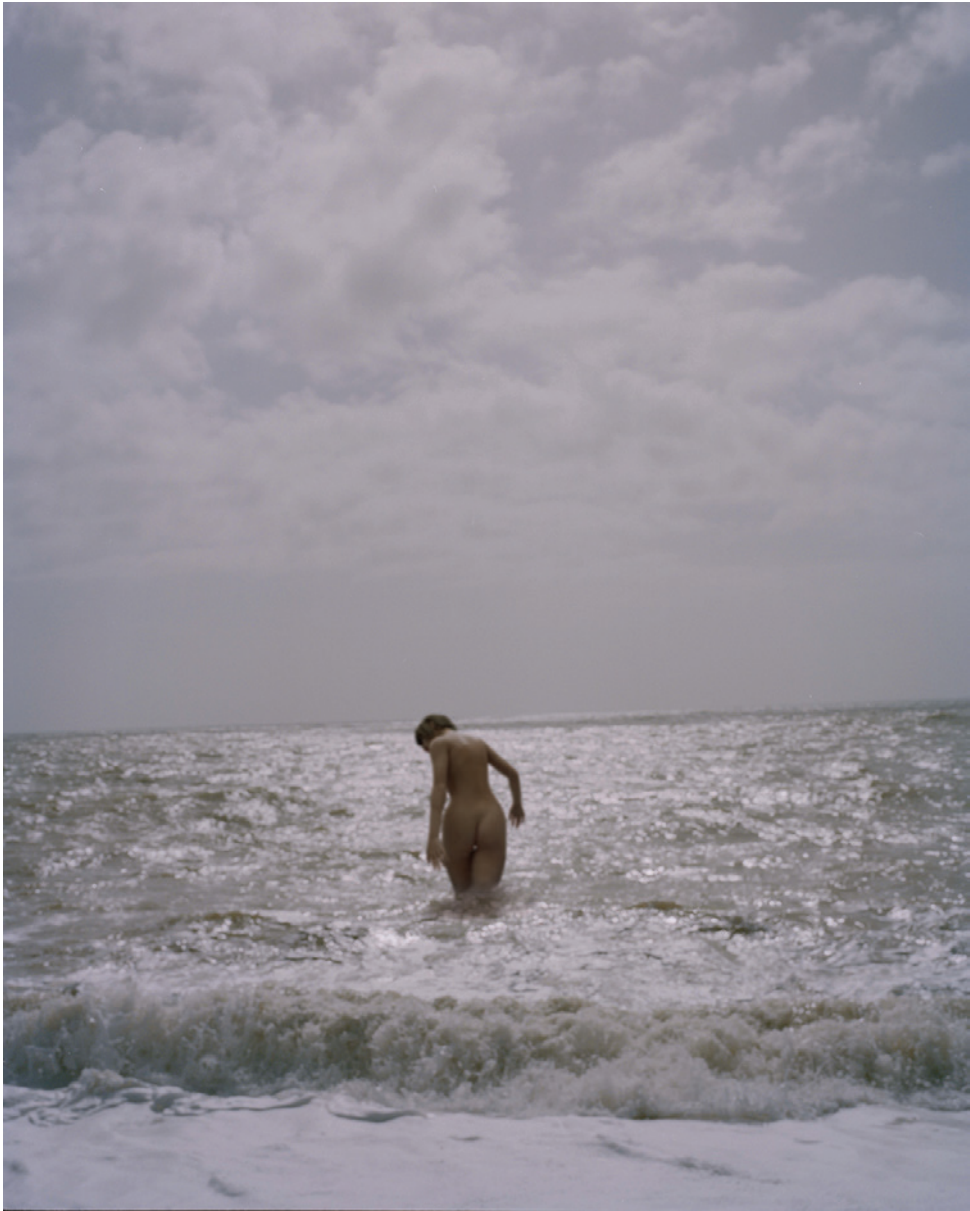
'Dream before Existence', 2023