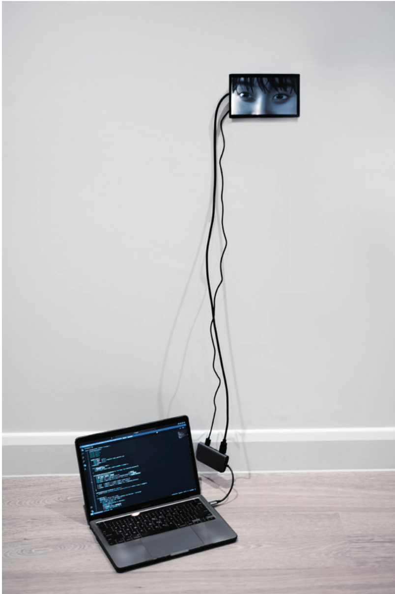
'Illusive Lover', 2023