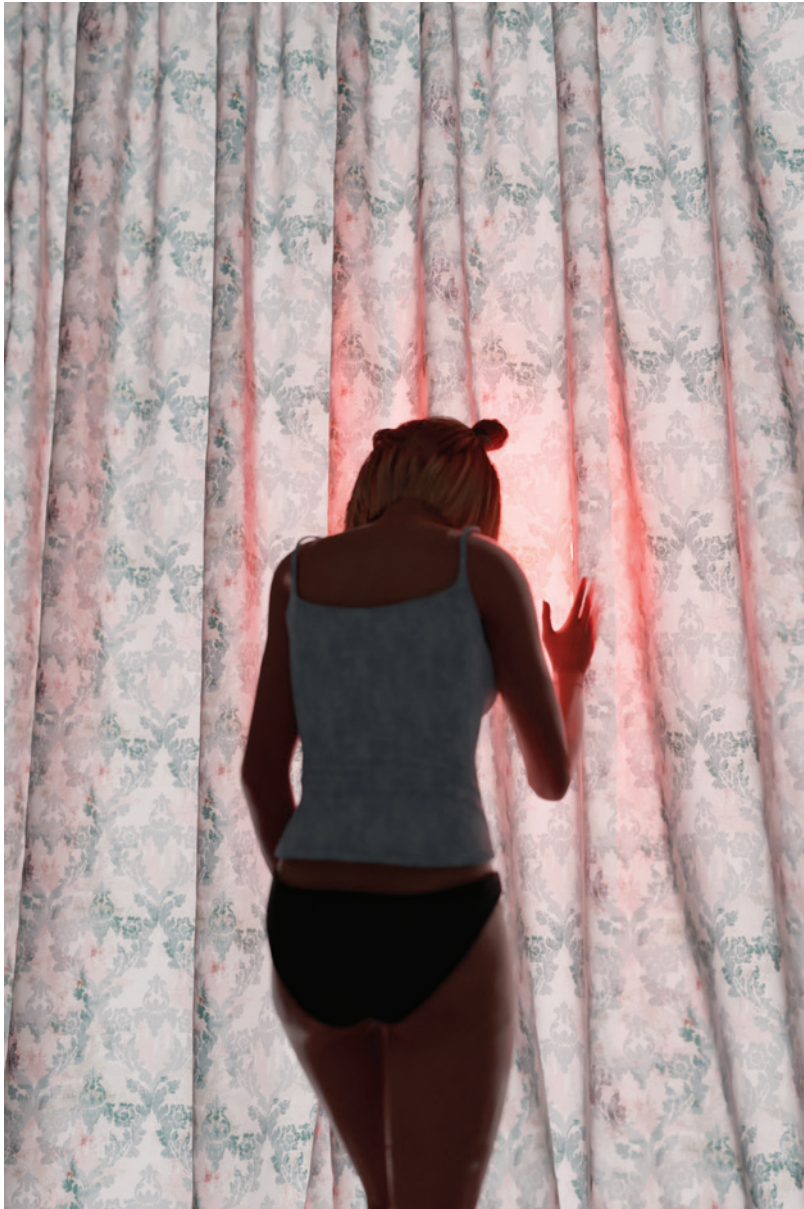
'Illusive Lover', 2023