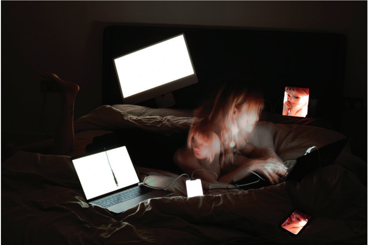
'Illusive Lover', 2023