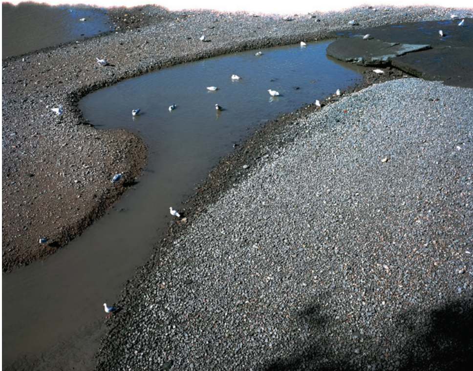
'Jump off the Vauxhall Bridge'', 2024