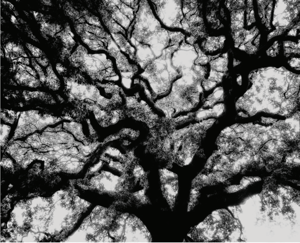
'Dream Before Existence', 2023