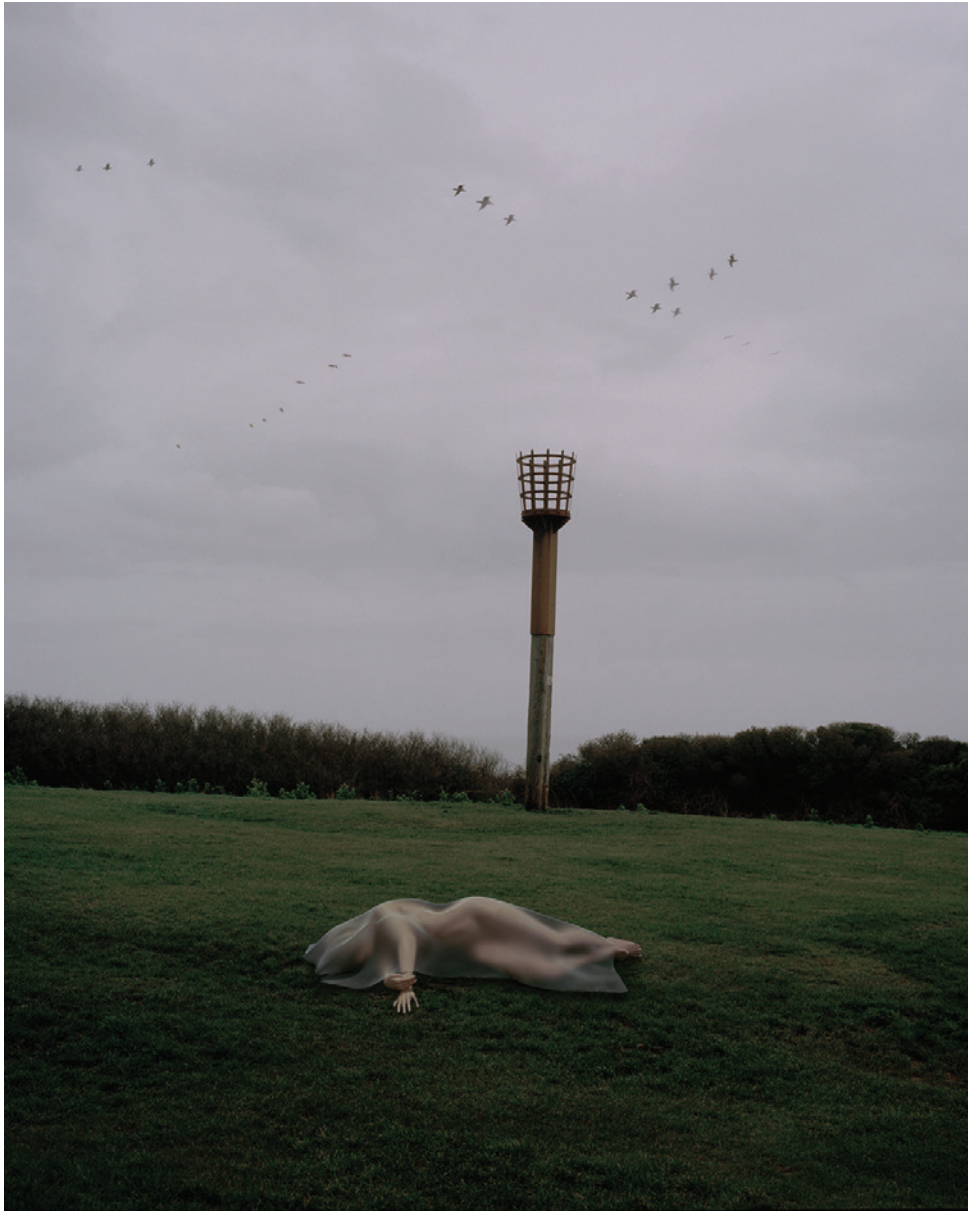
'Dream before Existence', 2023