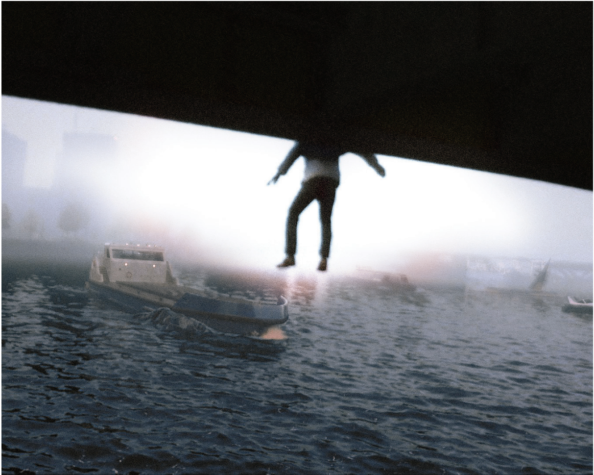
'Jump off the Vauxhall Bridge'', 2024