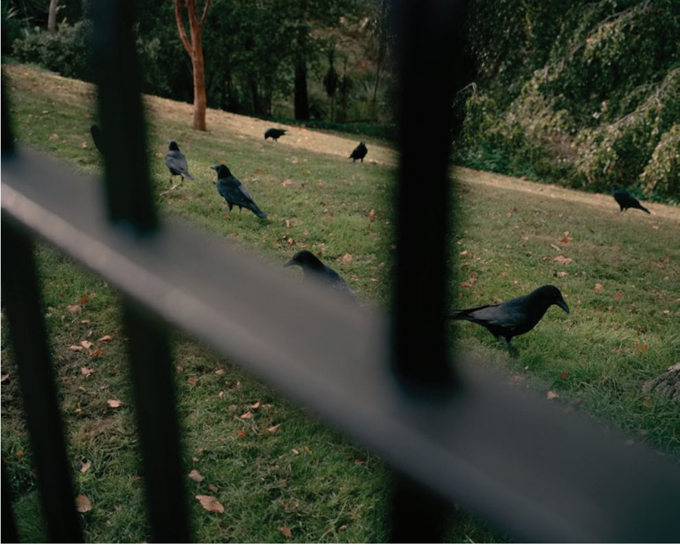
'Dream before Existence', 2023